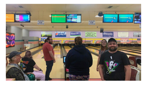
Extended Programming at Sparetime Recreation!