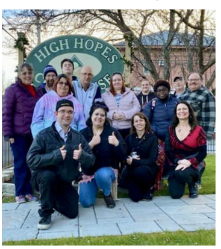
A group of Capitol Colleagues at High Hopes Open House event